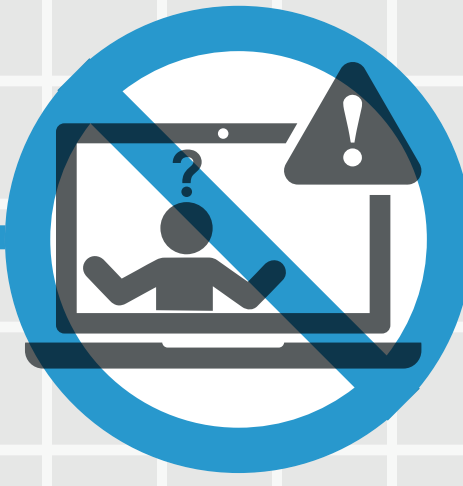
Reduce Human Error

1901 Group's Process Automation solutions effectively and substantially reduce human error and streamline allocation of resources; thereby, lowering customer costs, increasing productivity, and providing absolute priority to mission-critical systems.